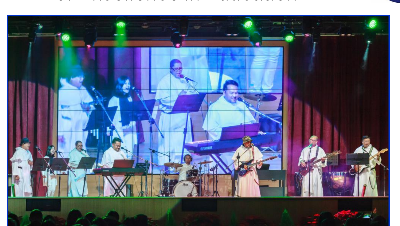
From 4 to 8 December 2017, the school celebrated a great milestone - 60 years of excellence in education.