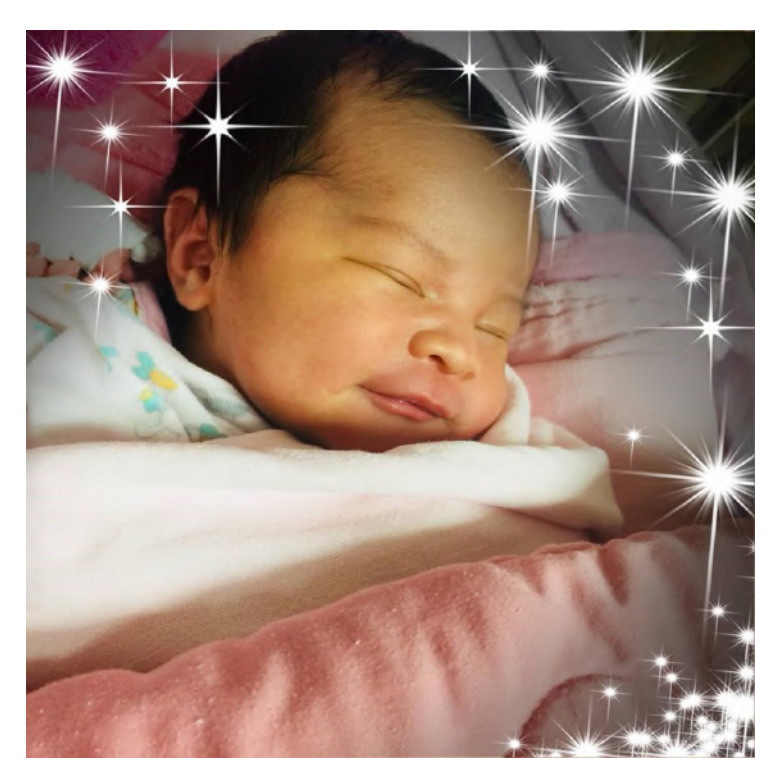
Fiat Mari Moje