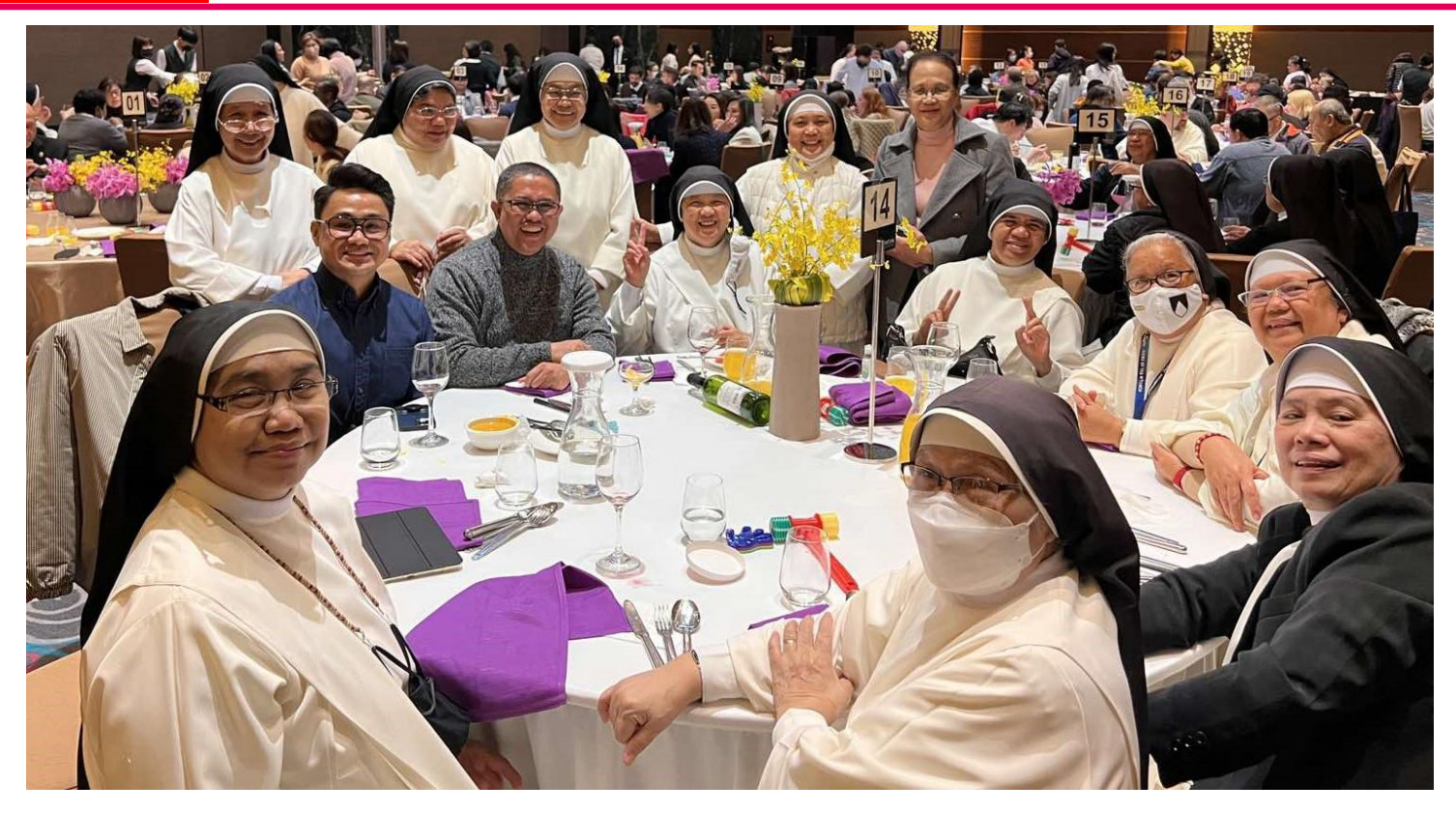
After the Mass, family, friends, and colleagues made their way to the Victoria Hotel for a celebration luncheon.