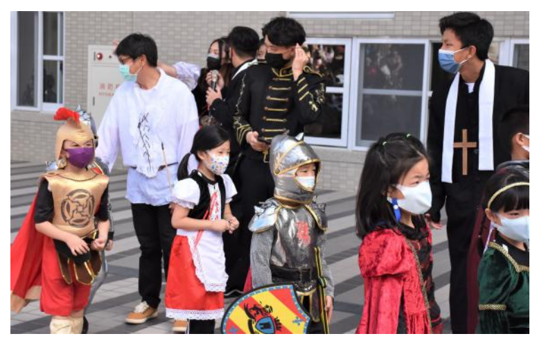
Left: Grade 12 students trying their steps in a medieval dance

Right: Grade I students showing off their costumes